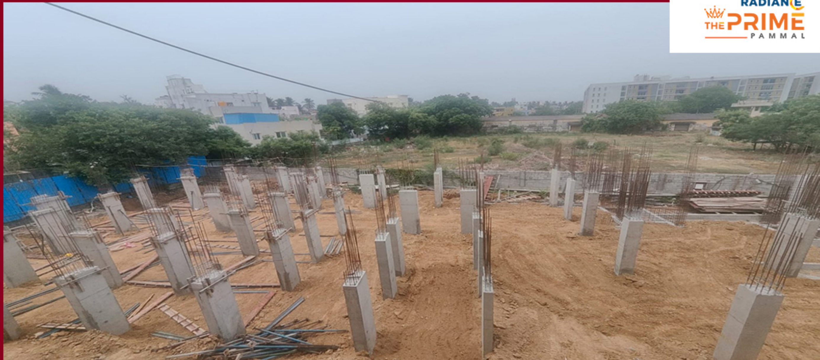
BLOCK 2 -CLUSTER G STILT FLOOR COLUMN RCC WORK IN PROGRESS