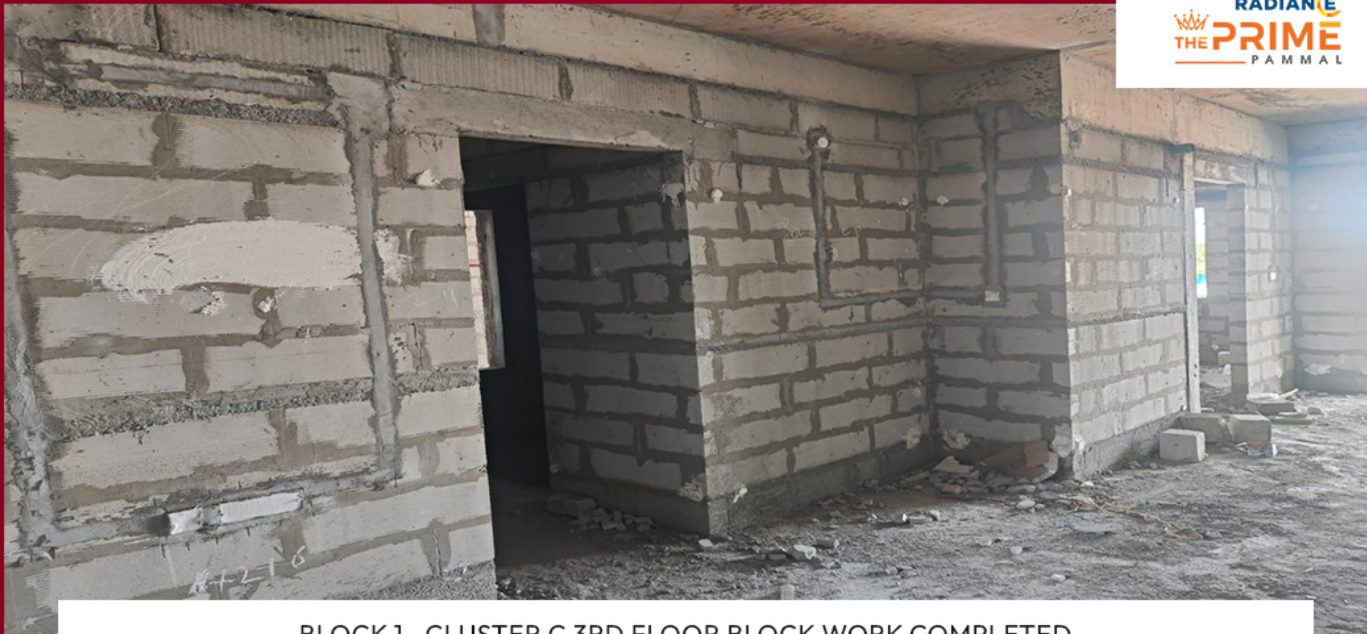
BLOCK 1 - CLUSTER C 3RD FLOOR BLOCK WORK COMPLETED