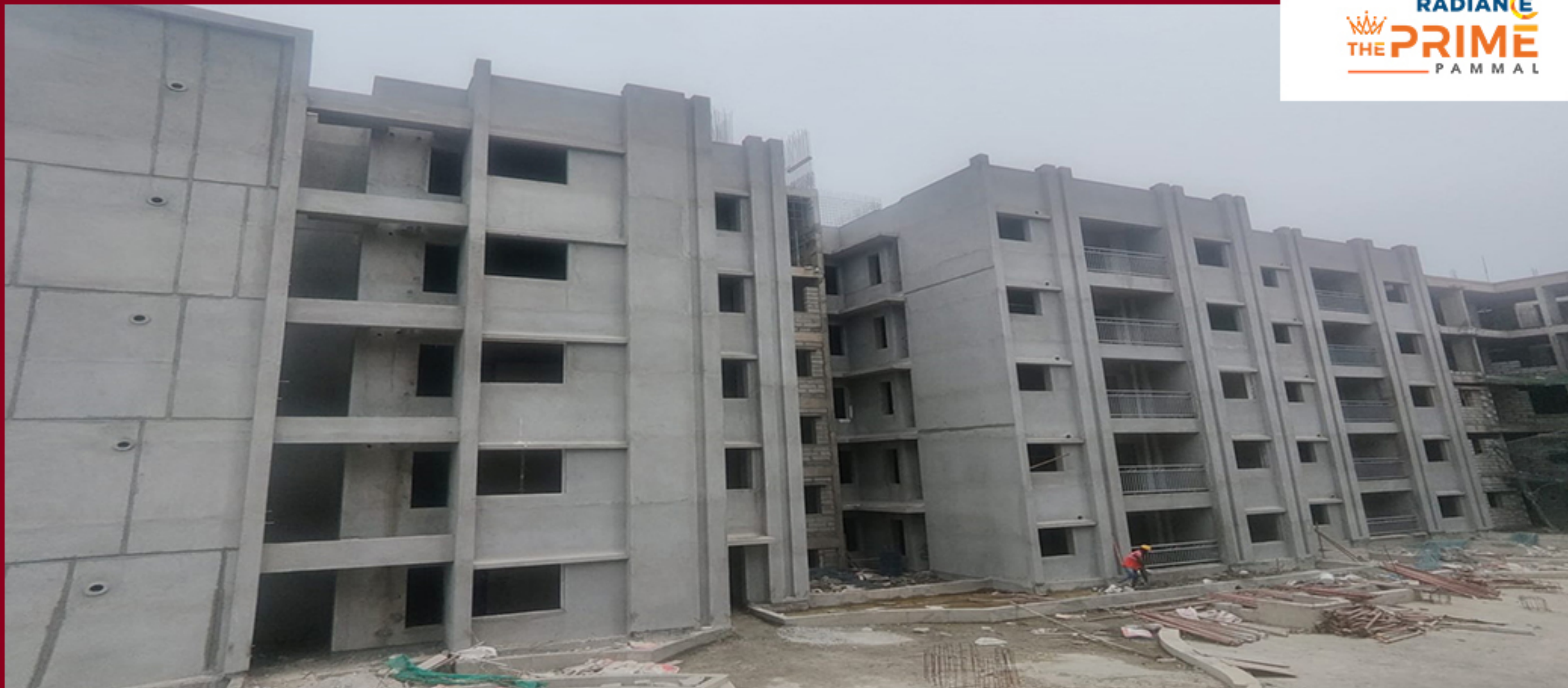
BLOCK 1 - CLUSTER D EXTERNAL PLASTERING WORK IN PROGRESS