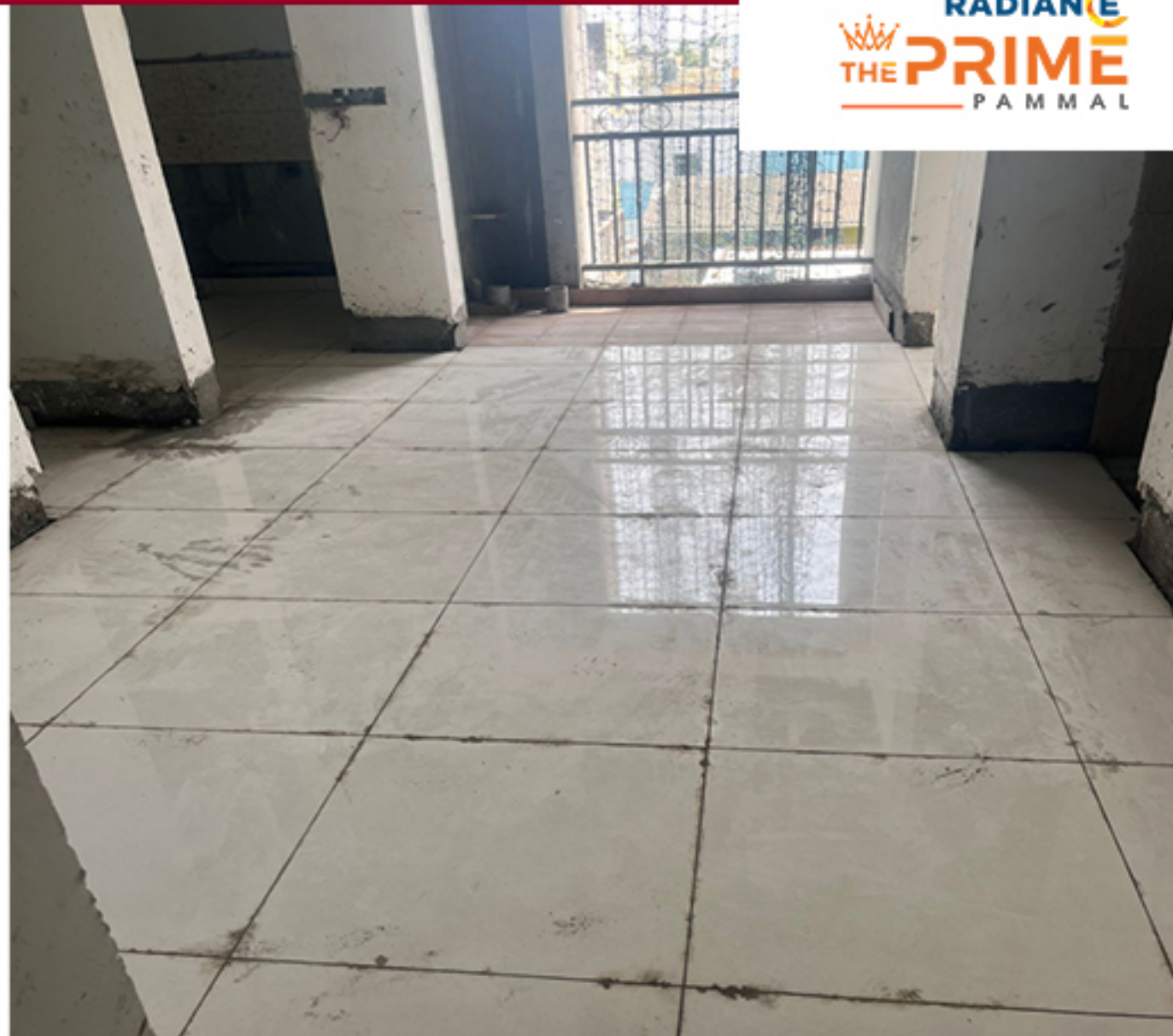
BLOCK 3 -CLUSTER J 1ST,2ND AND 3RD FLOOR TILE WORK IN PROGRESS