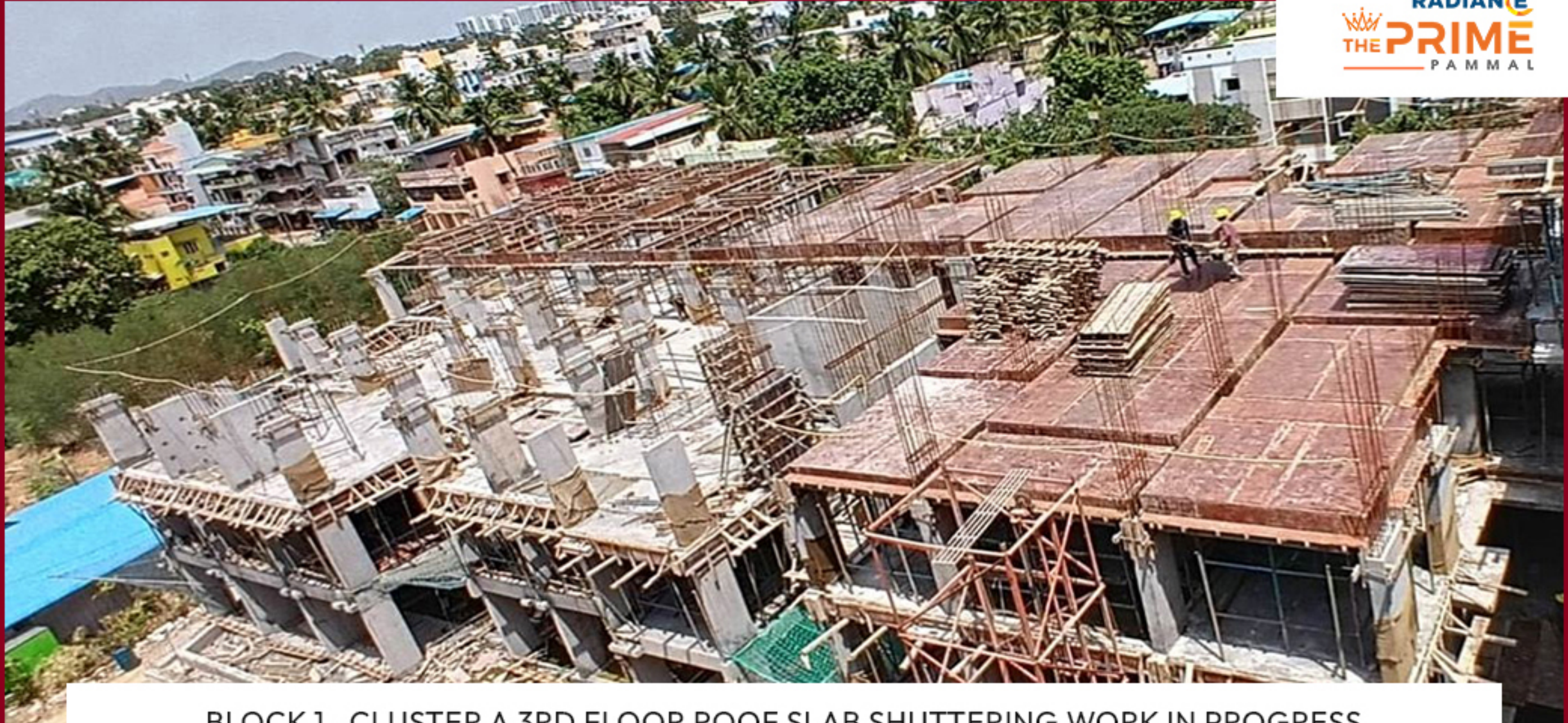
BLOCK 1 - CLUSTER A 3RD FLOOR ROOF SLAB SHUTTERING WORK IN PROGRESS