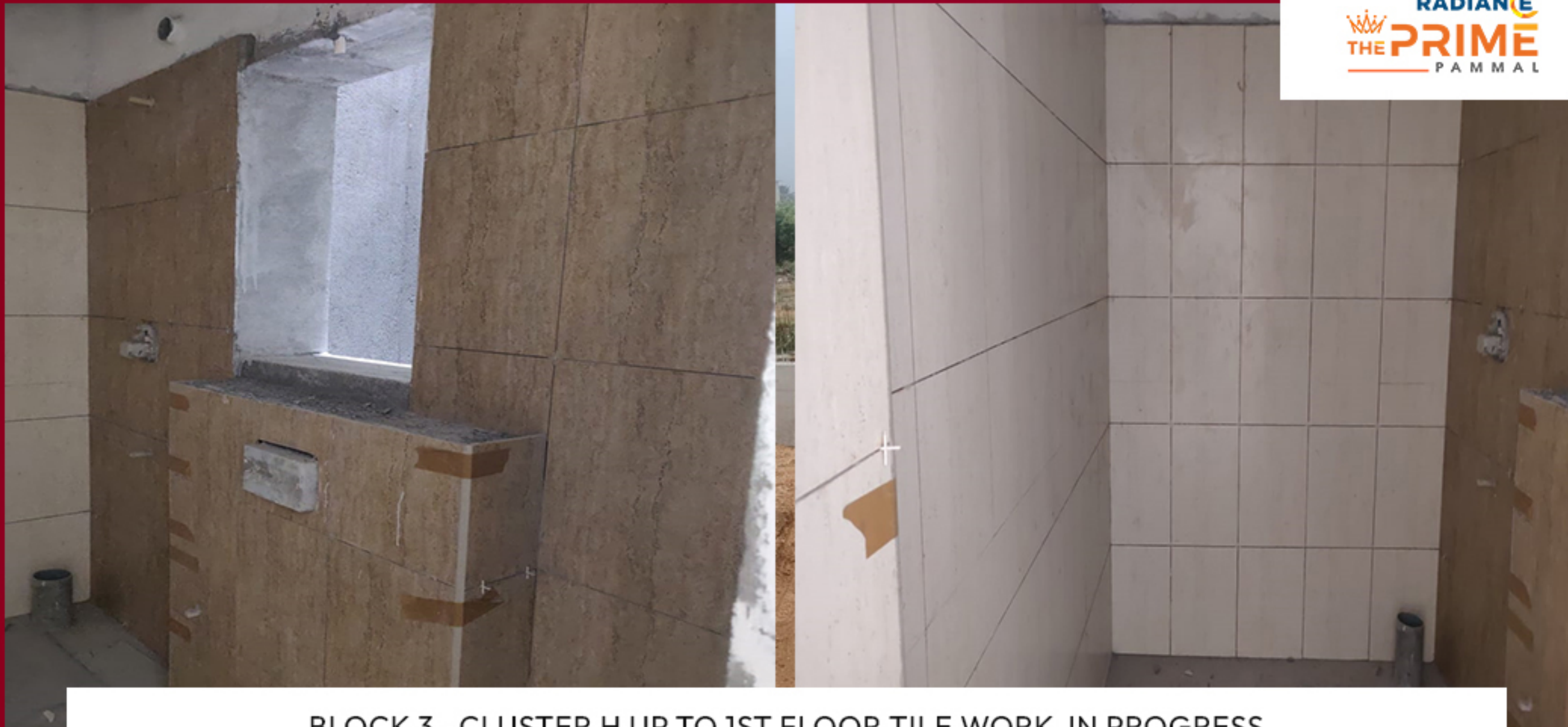
BLOCK 3 - CLUSTER H UP TO 1ST FLOOR TILE WORK IN PROGRESS