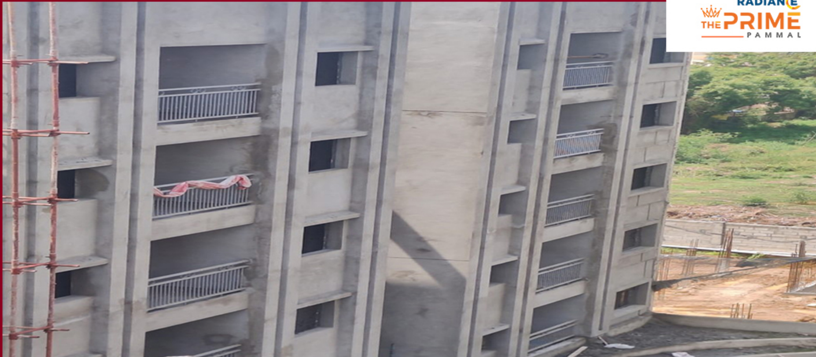
BLOCK 1 - CLUSTER F EXTERNAL PLASTERING WORK IN PROGRESS